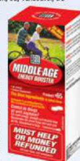
#65 NPN 80044126