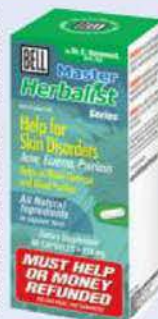
#60 NPN 80044199