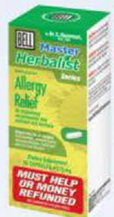
#24 NPN 80043542