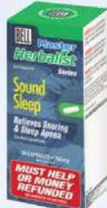
#23 NPN 80045172